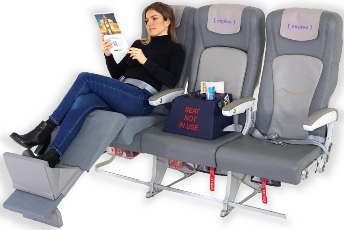
Standard: Expleo CRU solution (for ECO seats).